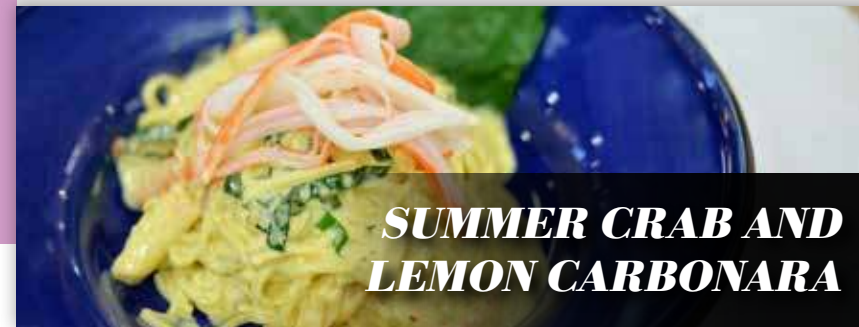
SUMMER CRAB AND LEMON CARBONARA

Fresh crab and lemon make this crowd-pleasing pasta dish perfect for summer.