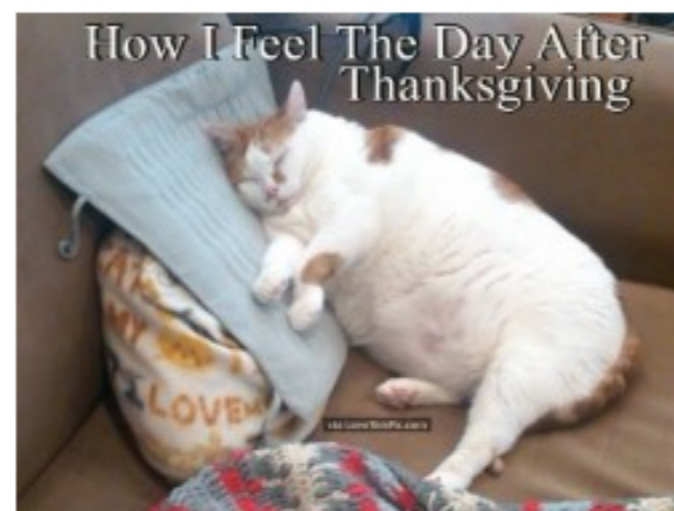
How I Feel The Day After Thanksgiving